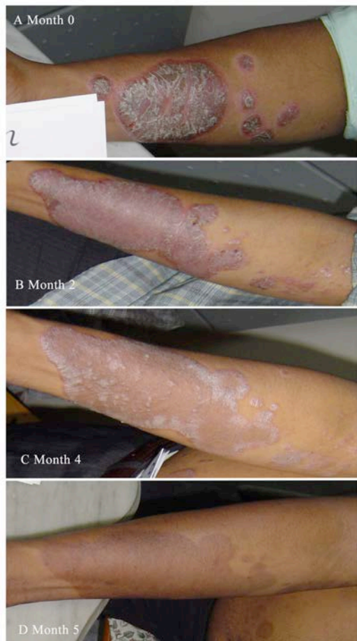
Fig.2 The subsided lesion areas fade away to a greyish color 图2 消退的原地皮肤变为灰色